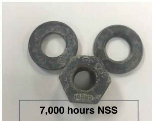
7,000 hours NSS