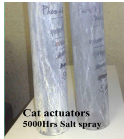
Cat actuators 5000Hrs Salt spray