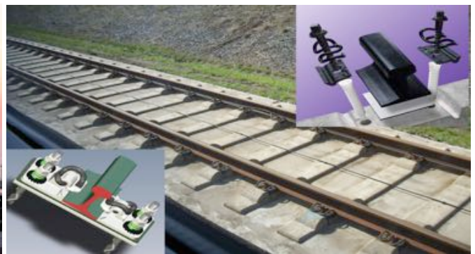
Railway fasteners across Europe