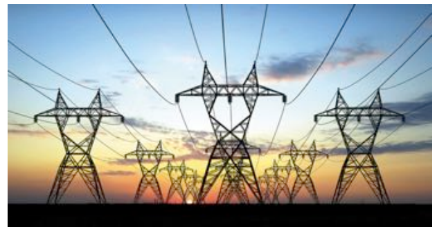
Pole line hardware across the US as well as transmission line hardware is now being protected with ArmorGalv ®