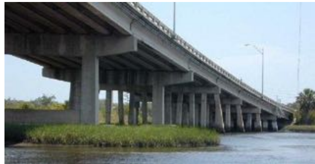
San Pablo River bridge Jacksonville Fl. – steel hardware